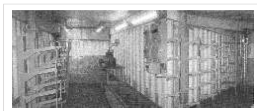
CONTAINER FITTED WITH FLP FITTINGS, JIB CRANE, TOOL RACKS & HEAVY DUTY VICE.