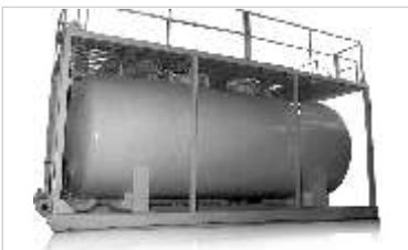
ACID TANK 5000 US GALLON