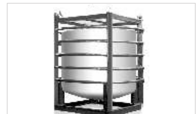
ACID TANK MOC SS WITH INTERNAL LINING