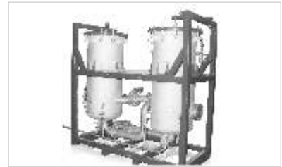
SKID MOUNTYED TWIN DUPLEX FILTERATION UNIT

Application : Completion Fluid. Cartridge Type : TH10-40-2 OF 10 Micron. Absolute Flow : 6.3 BBL/Min per Filter Vessel. Design Data : As per ASME Sec-VIII, DIV-1. Test Pressure : 225 psi.