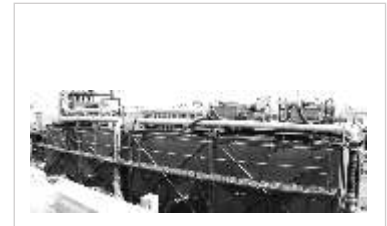
COMPLETE MUD AND SLUDGE TREATMENT PLANT FABRICATED AND INSTALLED FOR SINGAPORE CLEANSEAS PTE.